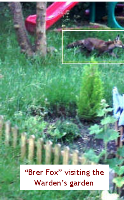
"Brer Fox" visiting the Warden's garden