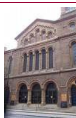
Westminster Chapel London