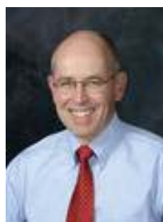
Dr Wayne Grudem